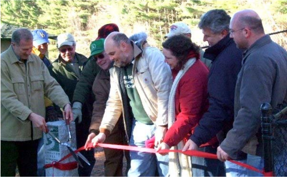
1 Ribbon Cutting to open RecPath on Dec. 13, 2008

We received the CFP Award of Merit at their annual meeting on September 6 th . This was a totally unexpected honor that was due to Shelton's on-going long term commitment to establishing trails, greenways and preserving farms and open space.