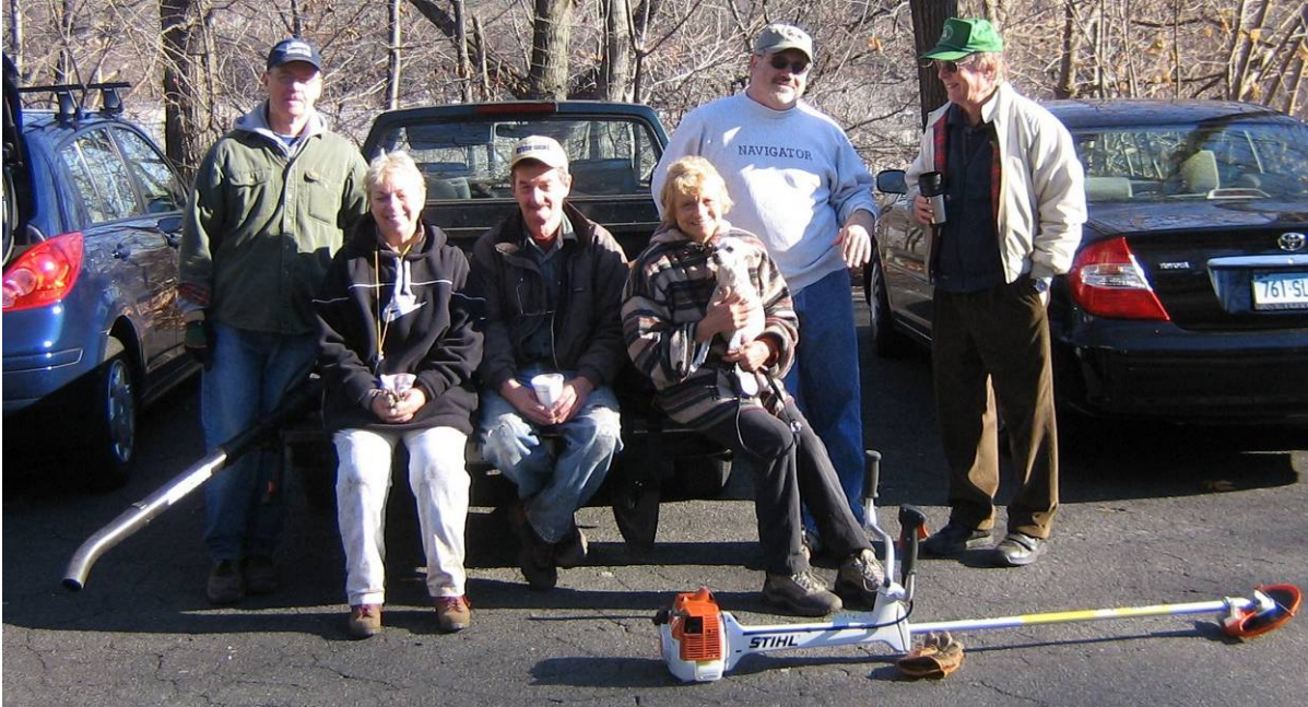
3 Shelton Trails Volunteers at Riverview Park in November

Volunteers have contributed over 700 hours of their valuable time to plan, construct, and maintain trails and open spaces this year. These efforts have provided significant benefit to the citizens of Shelton, and saved the taxpayers tens of thousands of dollars if the work had to be done by paid staff.