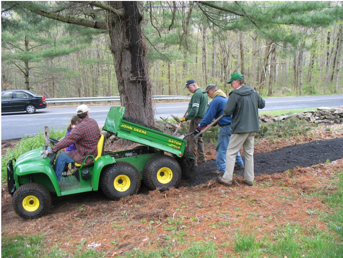
4 Volunteers using Gator to place millings on the RecPath at Nells Rock Road (Greenway House).

repair vandalism at some of the sign kiosks, but most of our trails seem to be staying vandal free as people use them more and more. The RecPath entrance at Pine Lake seems to be a persistent problem, and we have an on-going issue with graffiti there. Hopefully the City can come up with a better program to clean graffiti in 2009. A hydraulic lift was added to the Gator this year, which has been a big help in moving millings, rocks, and mulch. We also bought a large garden cart that has been useful moving mulch and tools. We also purchased a new Stihl clearing saw and hedge trimmer, which have been useful with briar removal along the power lines.