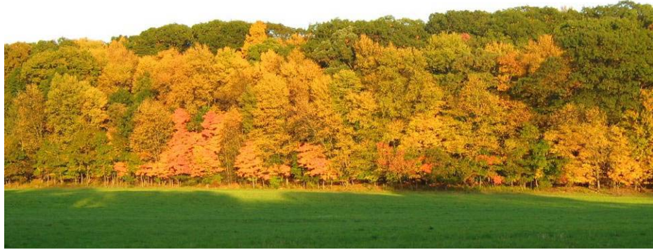
10 Scenic views from the RecPath of the Land Trust