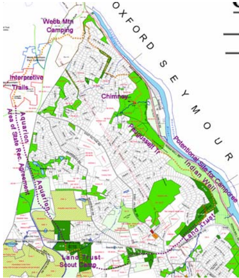
9 Teresa Gallagher's map showing Long-Range Plan for "Big Loop" Trail in White Hills