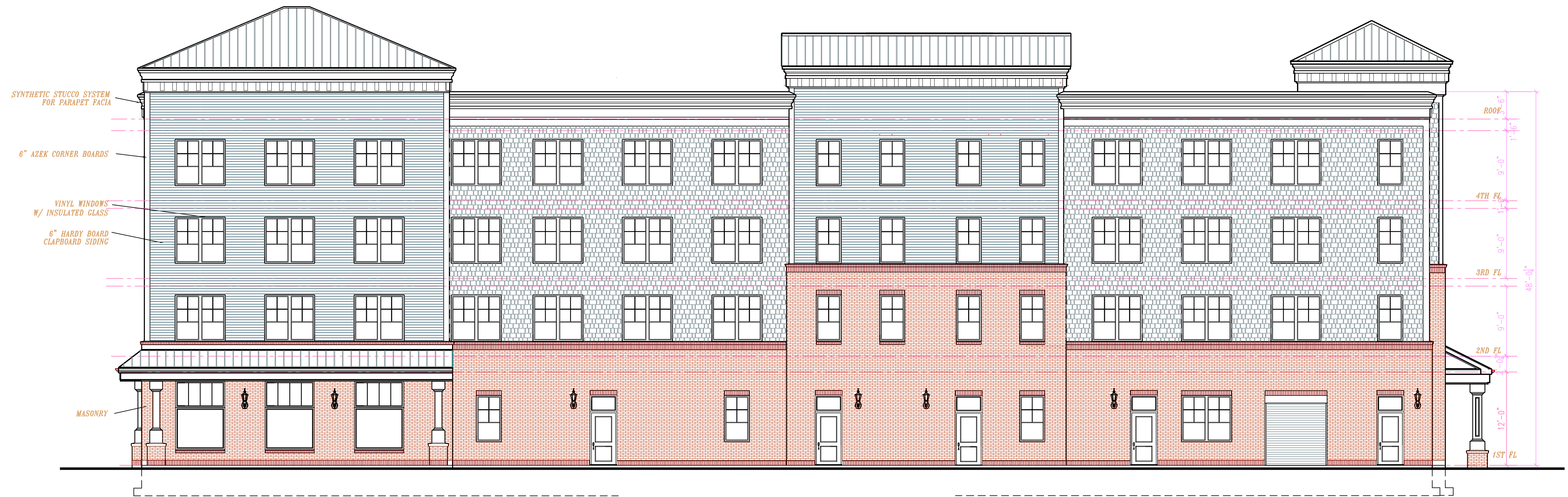
WEST SIDE ELEVATION (CANAL STREET W) SCALE - 1/8" = 1'-0"