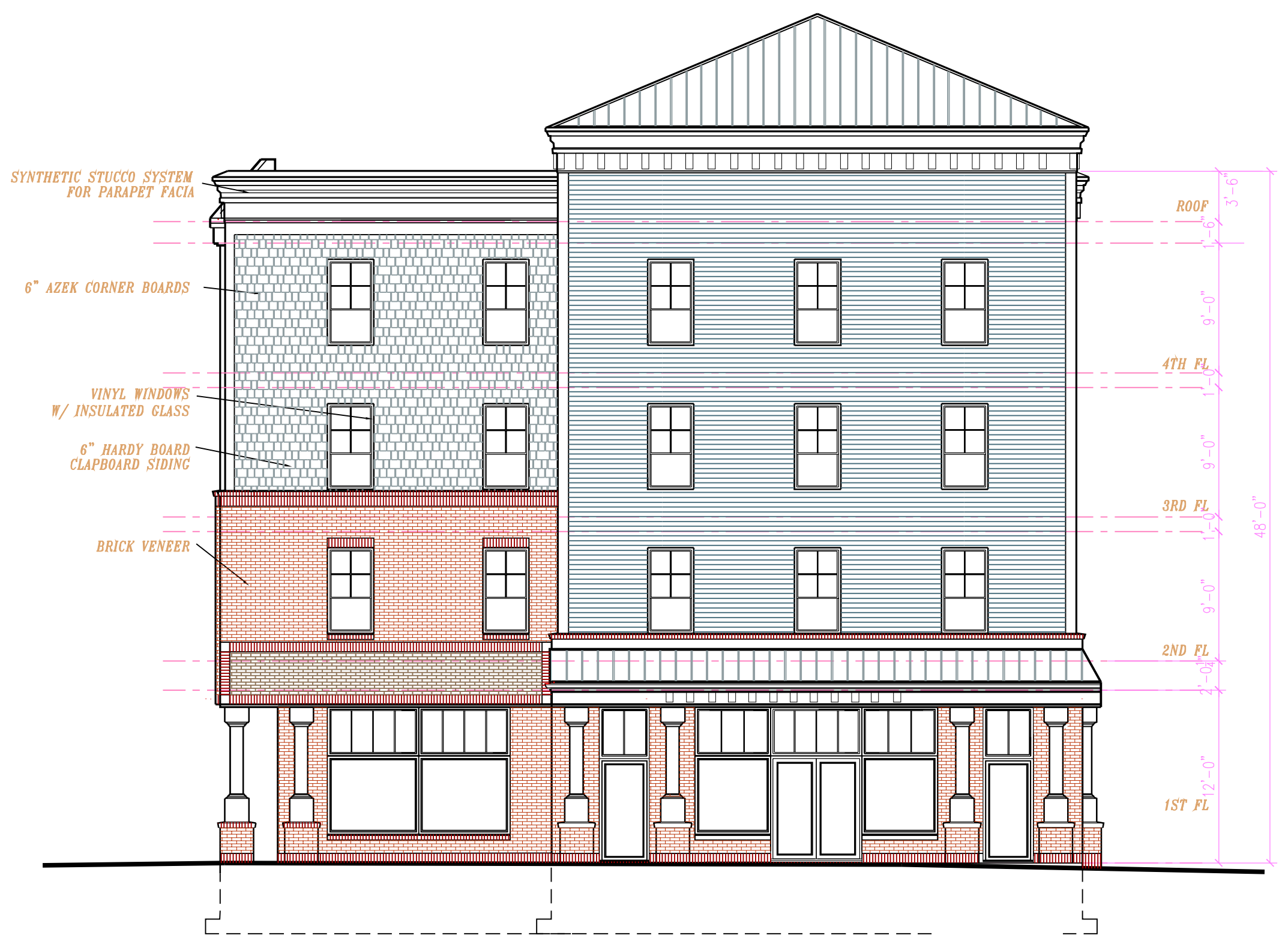
NORTH ELEVATION PLAN SCALE - 1/8" = 1'-0"